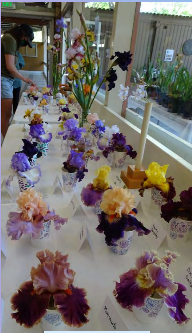
Blossom & Stalk Display