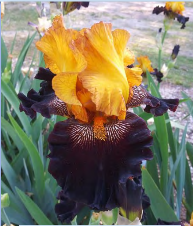
'Rise Like a Phoenix' (Paul Black, 2017)