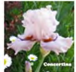
Reblooming Margaret Edgington