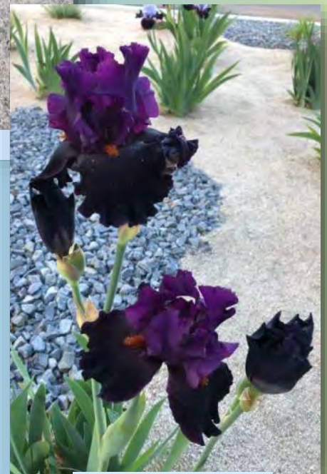
TB 'Dracula's Kiss'