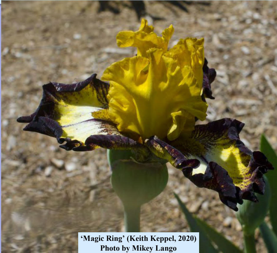
'Magic Ring' (Keith Keppel, 2020)