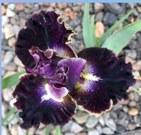
TB 'Exploding Galaxy'