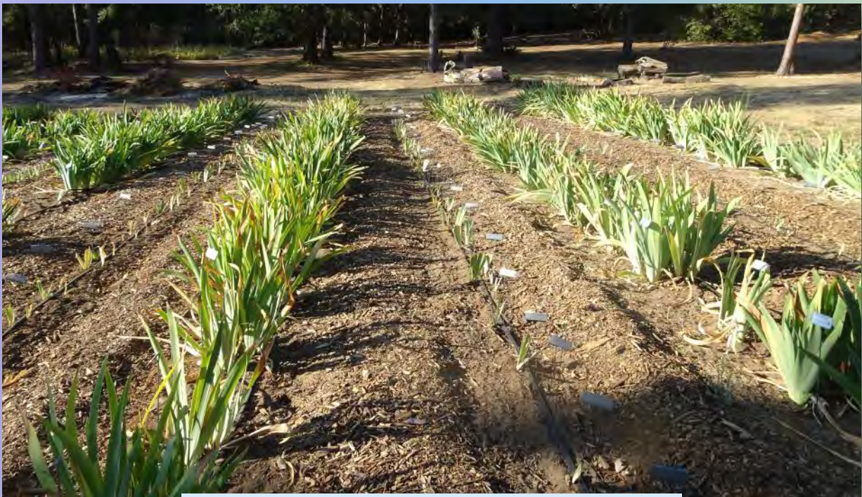
Bluebird Haven Guest Iris Garden prior to Aug. 1st dig