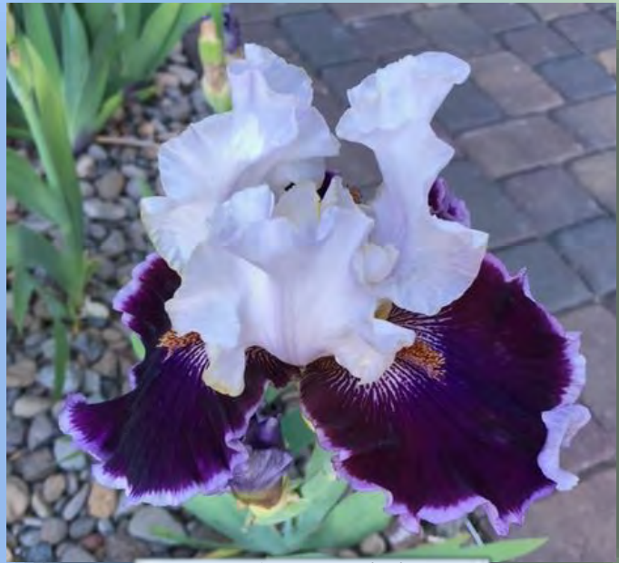
TB 'Roll the Dice'

Members who do not have access to a computer may ask the Editor for a printed copy at no charge.