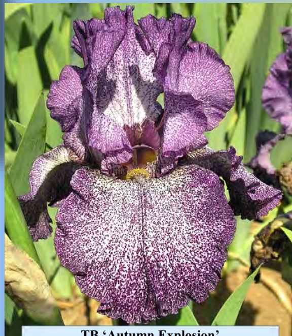
TB 'Autumn Explosion'