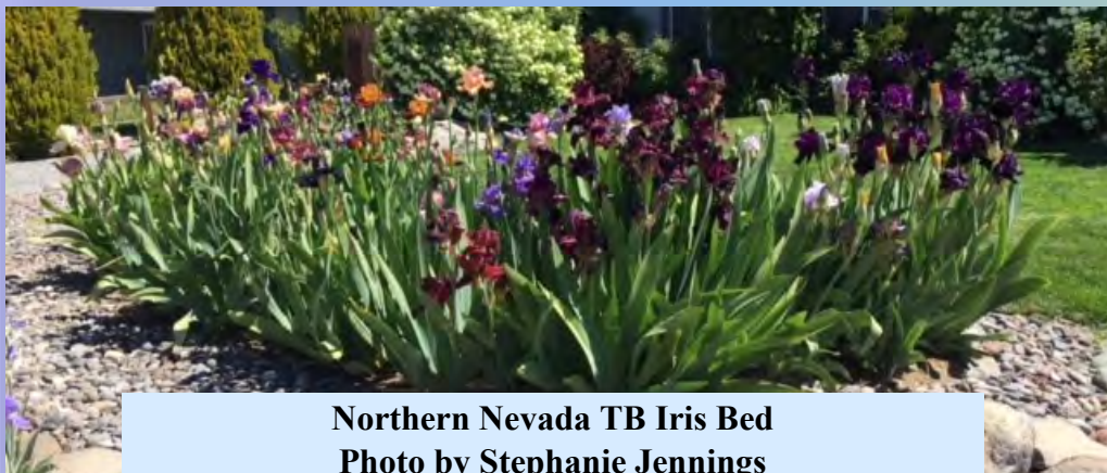
Northern Nevada TB Iris Bed