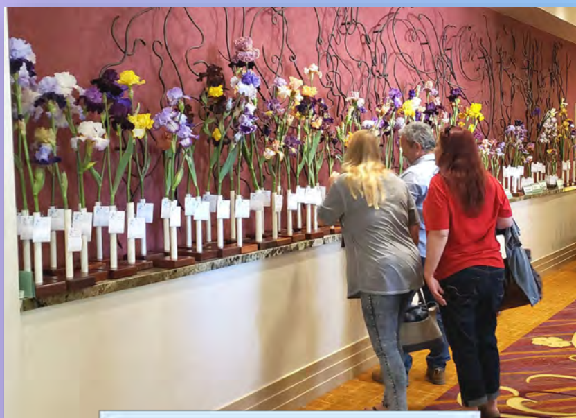
2019 AIS National Show