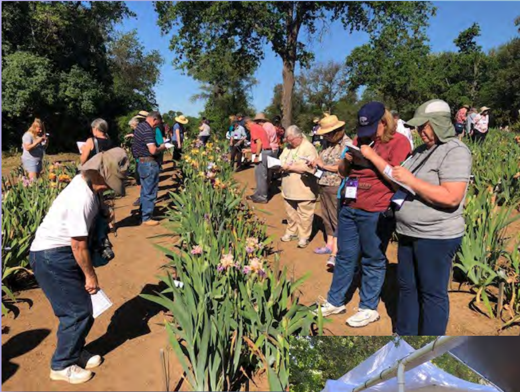
Attendees enjoying the Horton tour