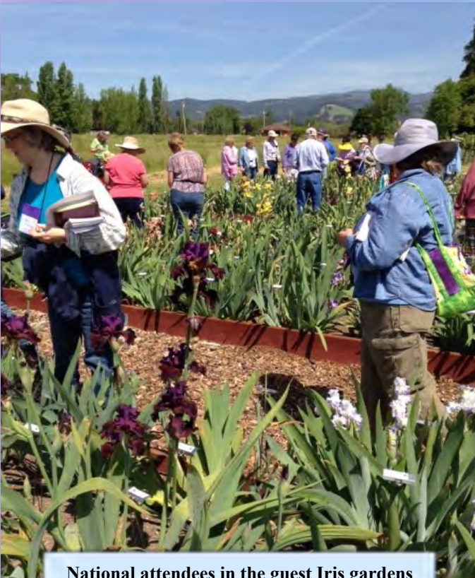
National attendees in the guest Iris gardens of Sonoma C&L Vineyard