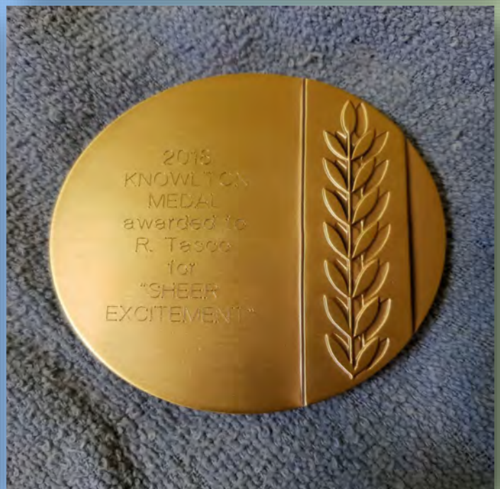
Knowlton Medal - Back