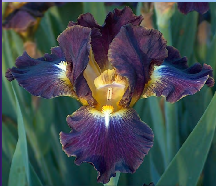
'Leave the Light On' (IB, Probst 2013)

**The registration form appears on the next page**