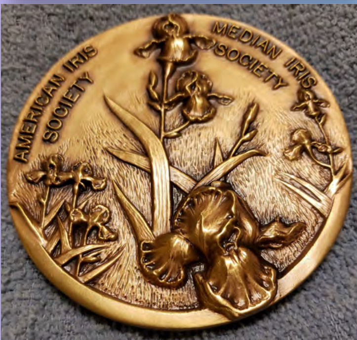
Knowlton Medal - Front