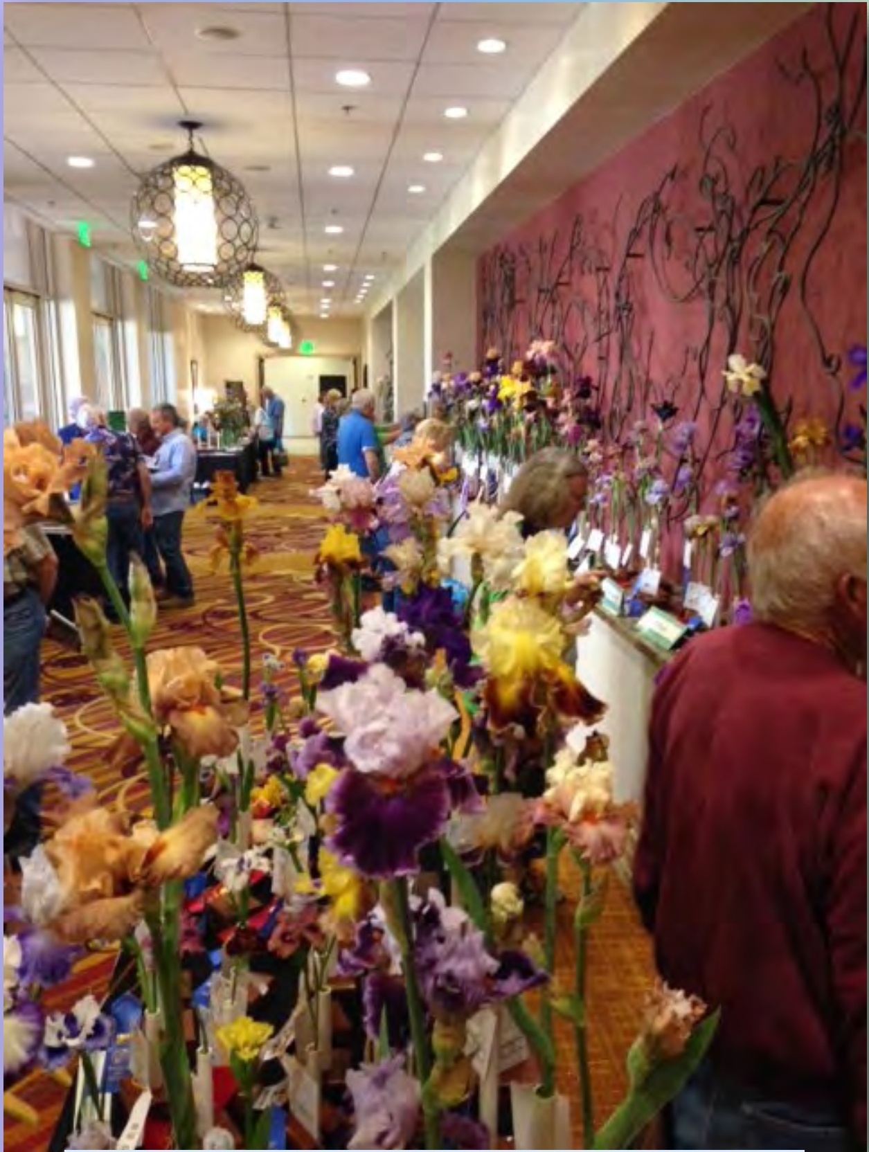
2019 National Iris Show judged by 4 teams of judges April 24th in the hall of the San Ramon Marriott