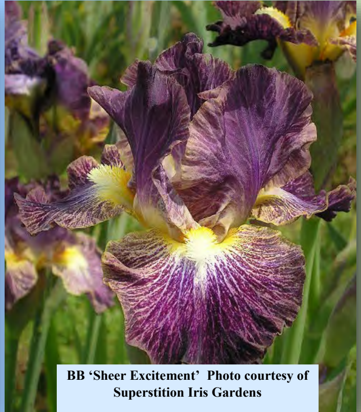
BB 'Sheer Excitement'