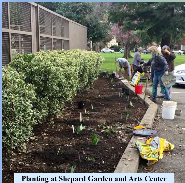
Planting at Shepard Garden and Arts Center