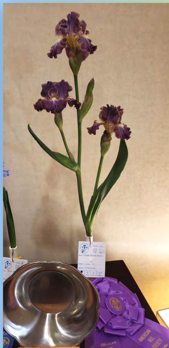
Best in Show BB 'Sheer Excitement'

Now wait a minute and digest this--Rick won the Knowlton Medal for Sheer Excitement, we not knowing in advance rode the Sheer Excitement bus, and Sheer Excitement won Best In Show, talk about Sheer Excitement overload! We were flying high on Excitement to say the least!