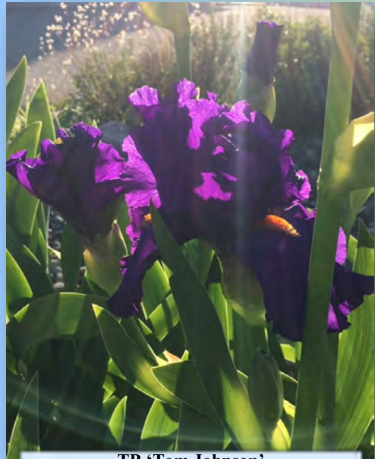
TB 'Tom Johnson'

Members who do not have access to a computer may ask the Editor for a printed