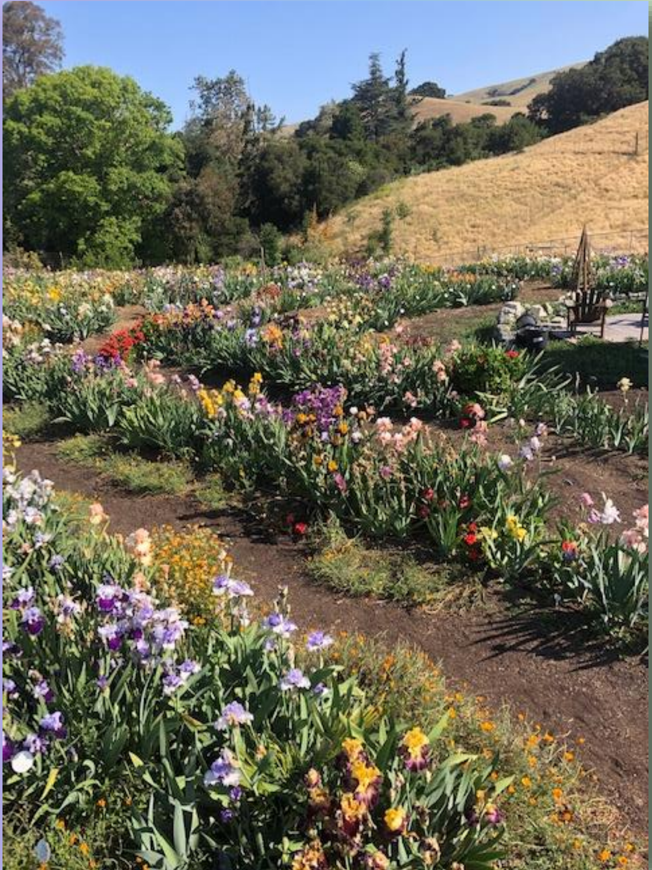
Dry Creek