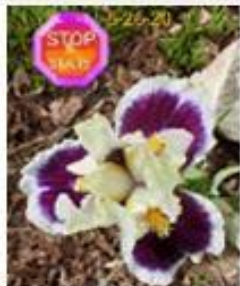
Stop and Stare