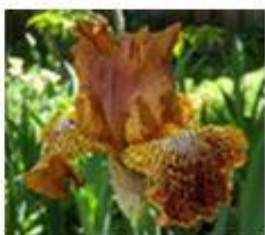
Tiger Shark 🌹