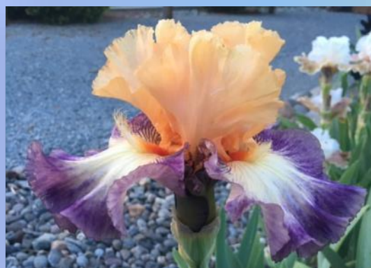
TB 'Tahitian Treat'