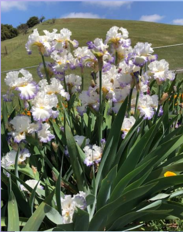
TB Honor Flight

Dry Creek Garden was allowed to have small numbers of society members come see the garden during peak bloom in the first week of May. Six Societies were represented by the visitors. CBRIS, MBIS, MDIS, SIS, SFIS and SBMIS. The May 3 rd Spring Regional would have perfect to see the most blooms on display - even more flowers than the 2019 Convention. So keep this in mind for 2022 when MDIS and SBMIS will once again host the Spring Regional at Dry Creek Garden in Union City.