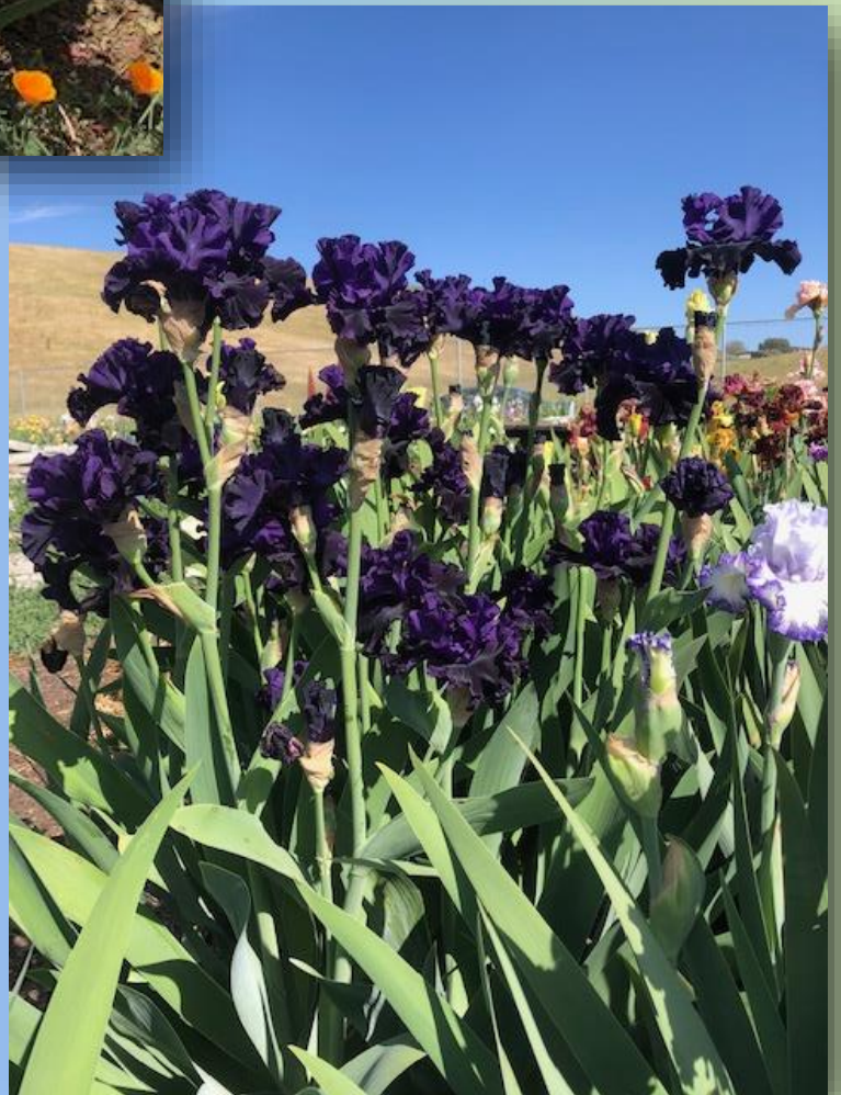
TB Black Lipstick