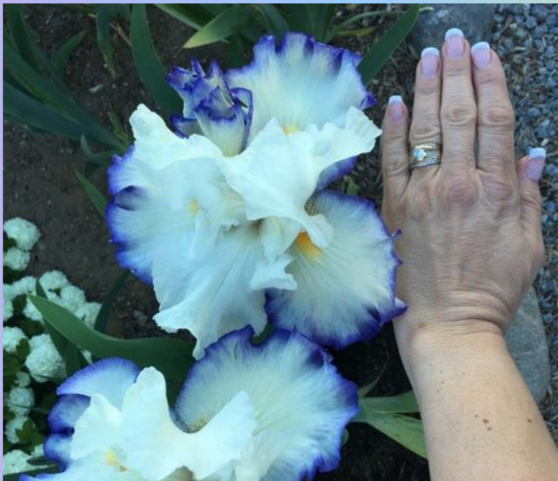
TB 'Queen's Circle'