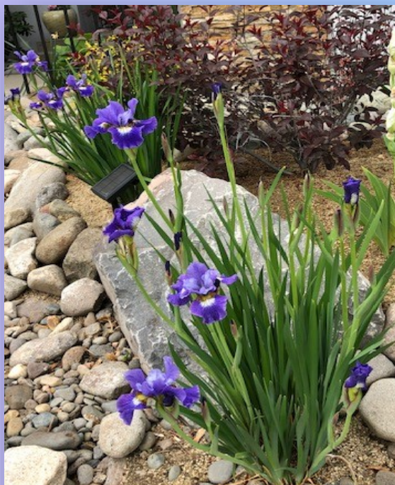
Louisiana Iris Thriving in the High Desert

President, Sydney B. Mitchell Iris Society