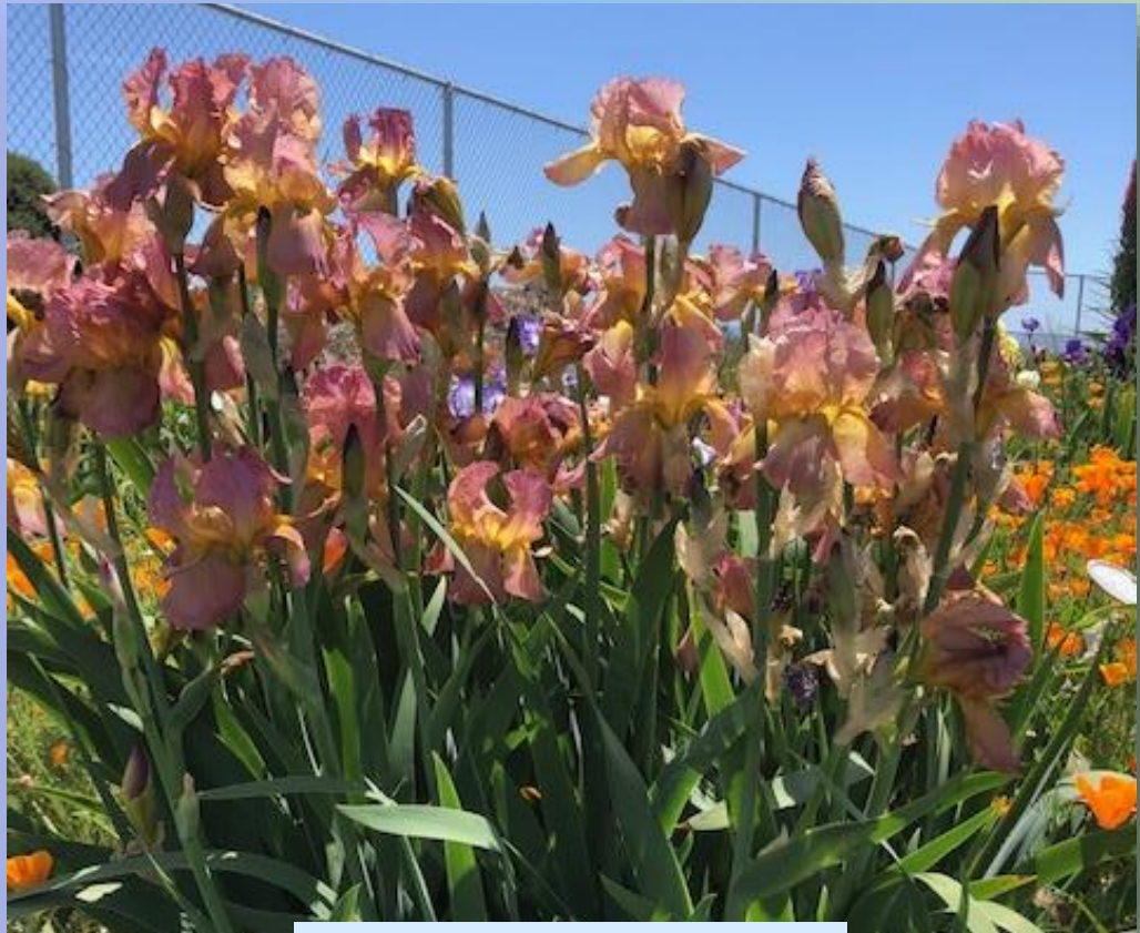
TB Pink Unicorn