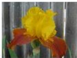
All That Jazz 🌹