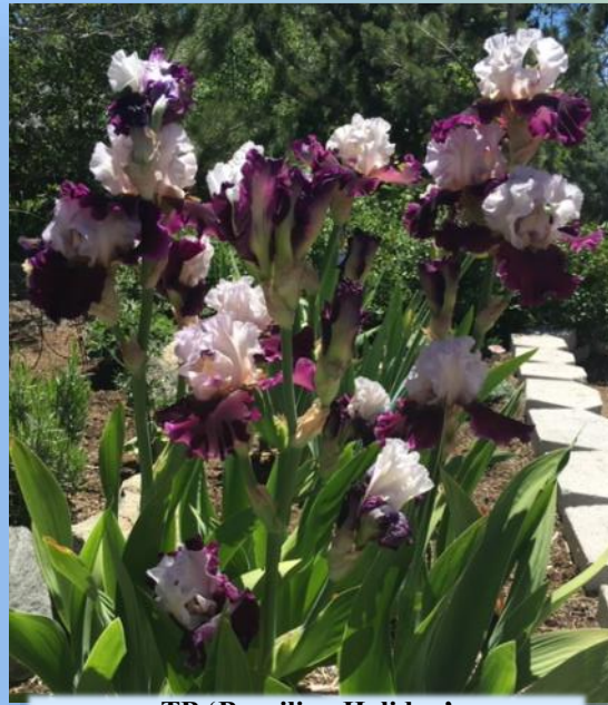
TB 'Brazilian Holiday'

Members who do not have access to a computer may ask the Editor for a printed copy at no charge.