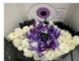
Iris, A Key Part of the Eye 🌹