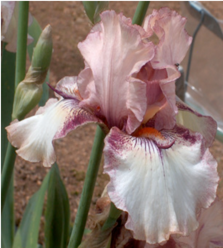
PICKED FOR PAT Bill Tyson 2018 TB $35