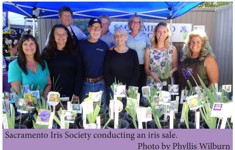
Sacramento Iris Society conducting an iris sale.