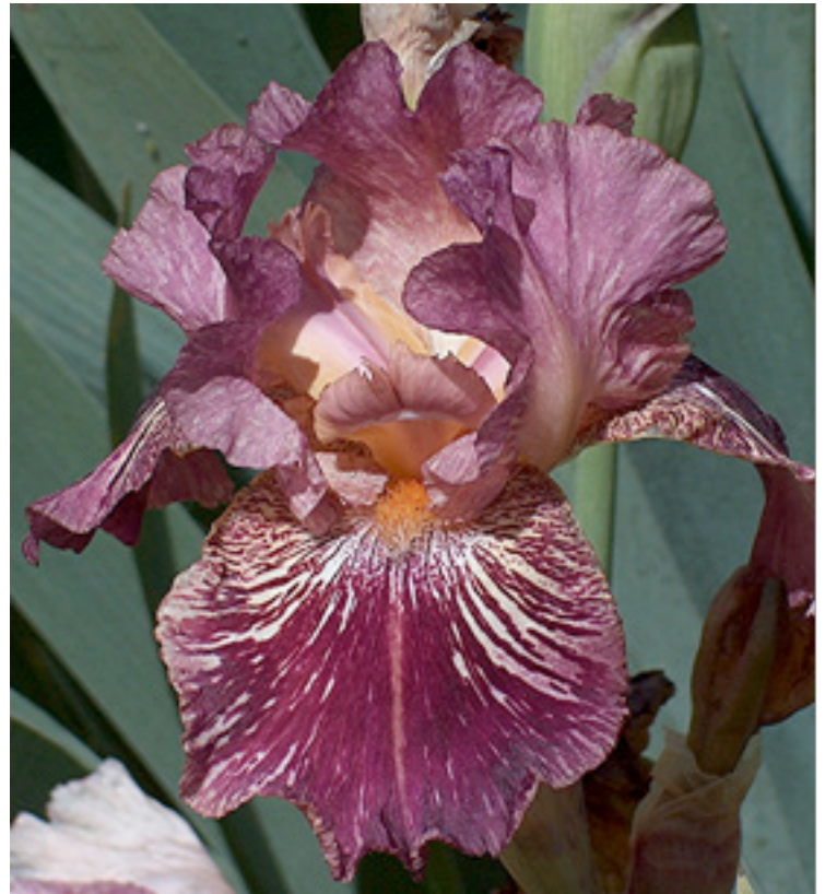
BLURRED VISION Bill Tyson 2018 IB $20