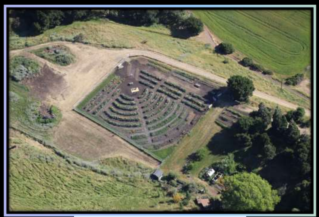
Aerial View of Dry Creek Iris Garden

The Crowne Plaza offers free parking and free WiFi.