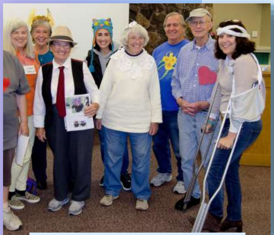
CBRIS Members Dressed as Irises

In celebration of Halloween, we encouraged our members "Come dressed as an Iris". The following iris were represented: Lightly Buttered, Stairway to Heaven, Gordola, Accidental Woman, Night Owl, Sharp Dressed Man, O Canada, Snow Flurry, and I Wuv Roses.