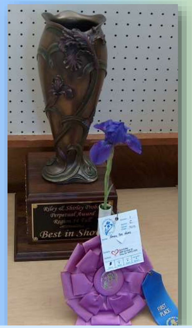
Best In Show SMELL THE ROSES (M. Byers 1988 SDB) Exhibited by Carol Cullen