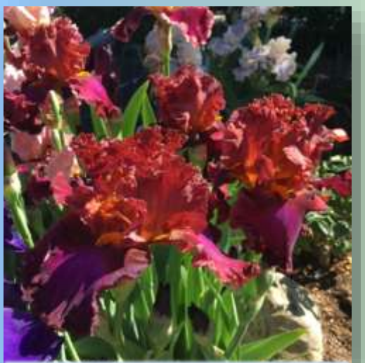
TB 'Ransom Note'

The Bulletin is published online in February and August by the American Iris Society's Region 14, a nonprofit mutual benefit corporation whose sole purpose is promoting the culture and improvement of the genus Iris. Members who do not have access to a computer may ask the Editor for a printed copy at no charge.