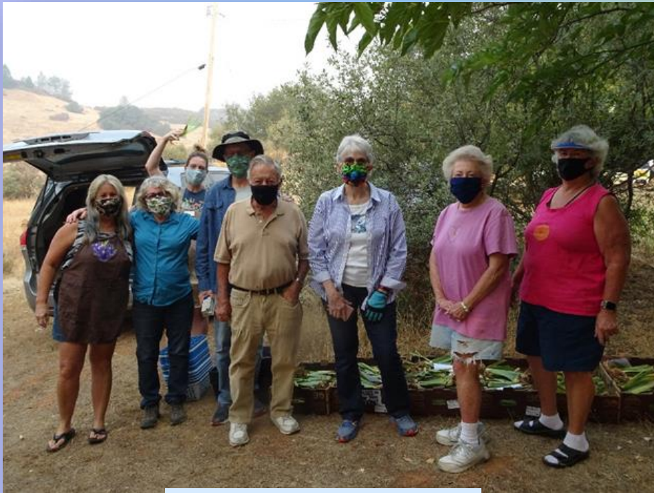
The Hardworking SIS Team