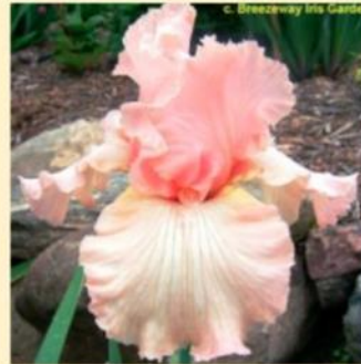
Beverly Sills 1985 #12 TB Symposium