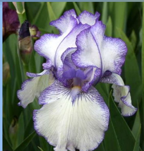
TB 'Hemstitched' (Hager, 1990)