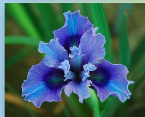
Garry Knipe Seedling 1613_2