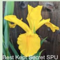
Best Kept Secret SPU