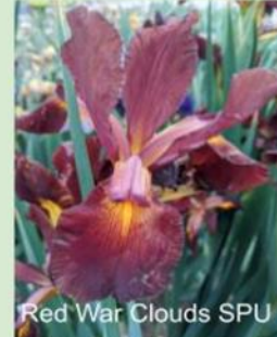
Red War Clouds SPU