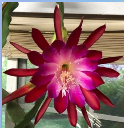
Epiphyllum 'Pure of Heart'