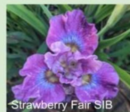
Strawberry Fair SIB