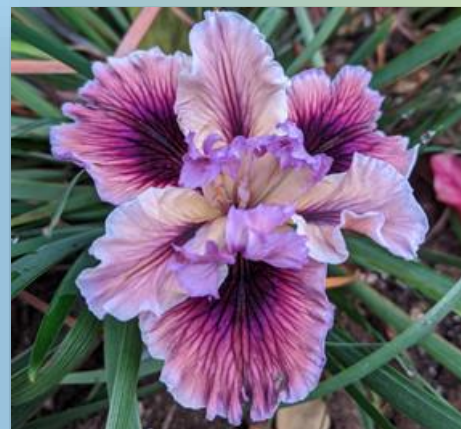
PCN 'Premonition of Spring' (Knipe, 2021)