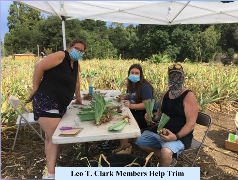
Leo T. Clark Members Help Trim at Dry Creek Garden