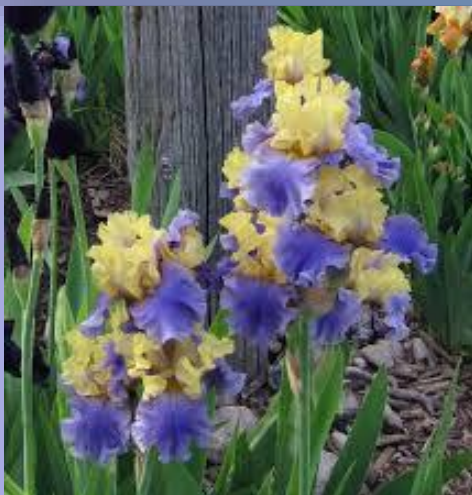
TB 'Edith Wolford' (Hager, 1986)