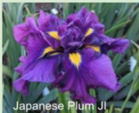
Japanese Plum JI