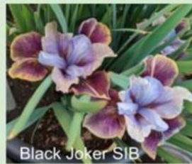
Black Joker SIB