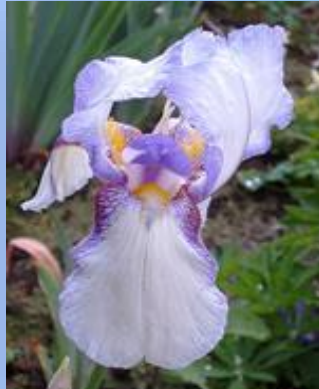
'San Francisco' (Mohr, 1927)