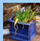
A-Top View B-Side View C-Full-stalk D-GLAMOUR shot