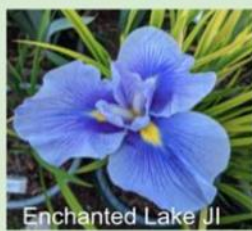
Enchanted Lake JI