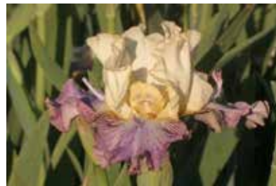
R. Probst 2013 TB-SA $15