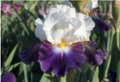
S. Trio 2012 TB $12