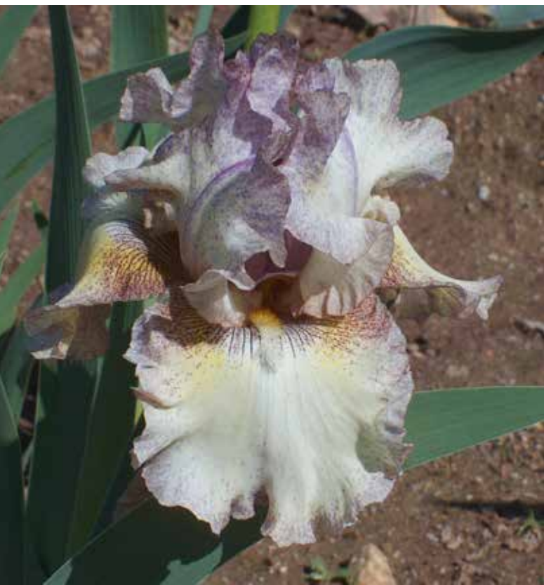
left: Happy New Year (Byers 1990), blooming March 2017