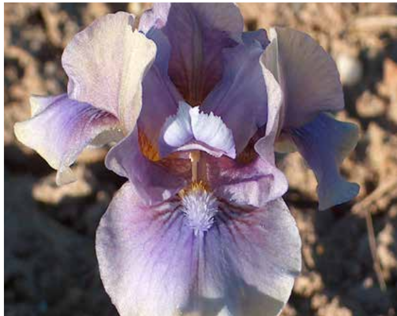
above: Inner Space (SDB) (Tasco 2009), blooming this spring

Learning more about irises is something we all want to do, and judges' training provides a focused vehicle to do this. The rigorous AIS Region 14 Judges' Training program helps ensure that judges have the requisite knowledge to recommend truly outstanding irises to the gardening public to help "spread the word" about our favorite flower. The Region 14 requirements for classroom, garden, and exhibition training for each level of judgeship, from Candidate (Student), through Apprentice, Garden/Exhibition, Master, Retired, and Emeritus judges are found in the document "Guidelines for Training and Accreditation of Judges", which is included on the Region 14 website ( www.aisregion14.org – click on Events and then on Judges' Training). Anyone considering becoming an AIS judge should download this document and study it.