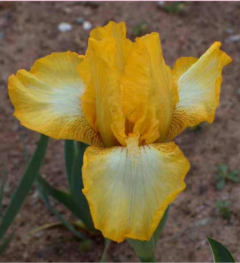
above: Good Day Sunshine (IB) (Lauer 1998) below: Gold Reprise (Moores 1988)