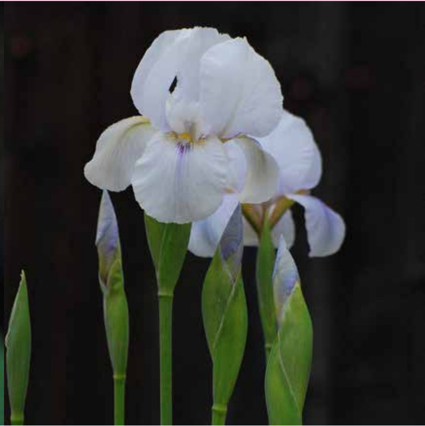
above: Sizzle (AB) (OGB) (Gadd 1978)