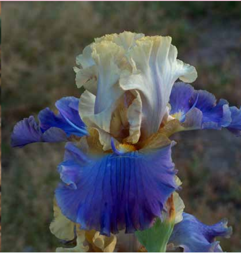
above: Pieces of April (Burseen 2005)