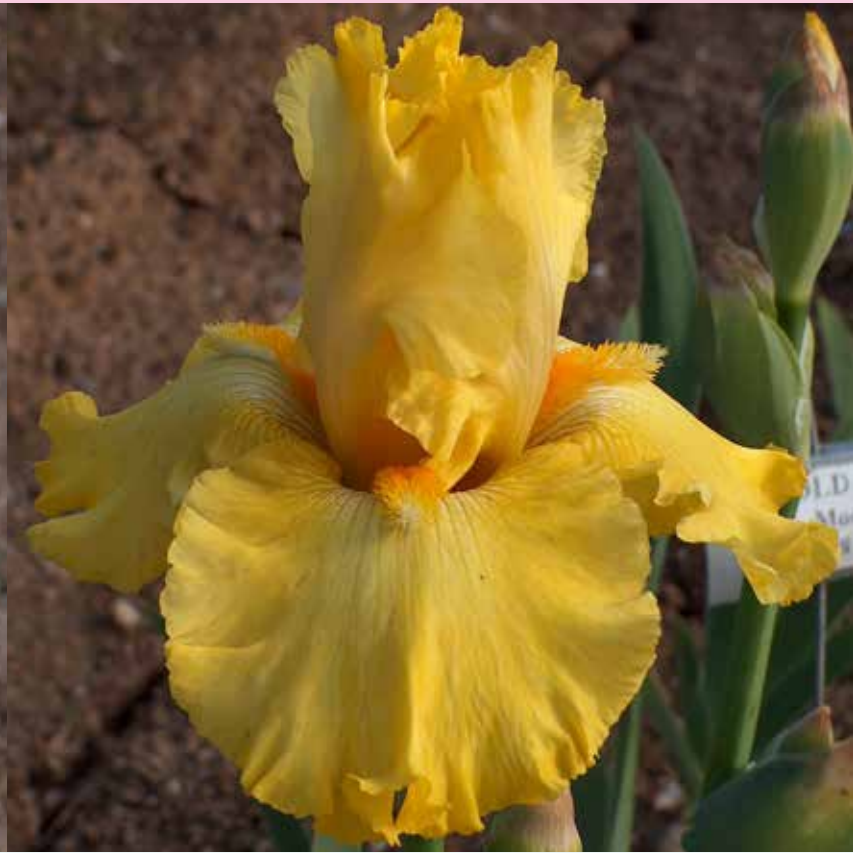
above: Golden Immortal (G. Sutton 1997) below: Golden Violet (SDB) (Weiler 1993)