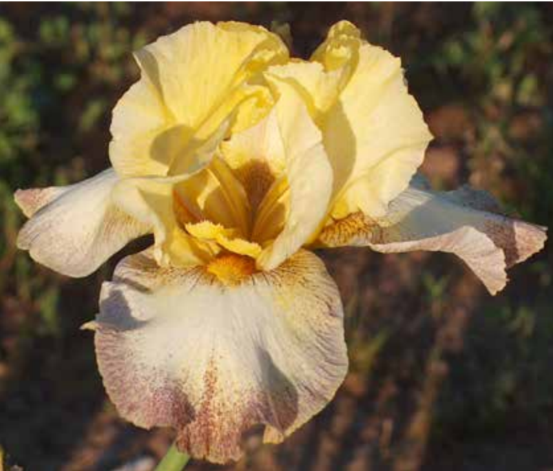
above: Barn Dance (Byers 1991)

Region 14 is a good area for rebloom. To encourage your rebloomers to rebloom, give them extra water and fertilizer, particularly after spring bloom. And some iris are just showing early bloom!