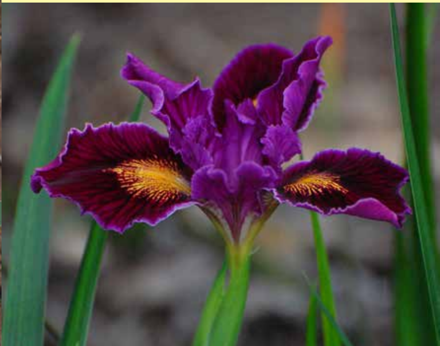
below: Drive You Wild (PCI) (Ghio 1986), blooming March 2017