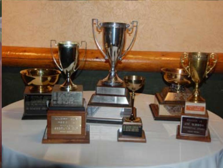
above: The trophies