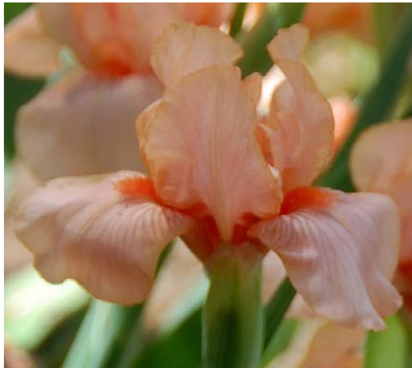
above: 1610