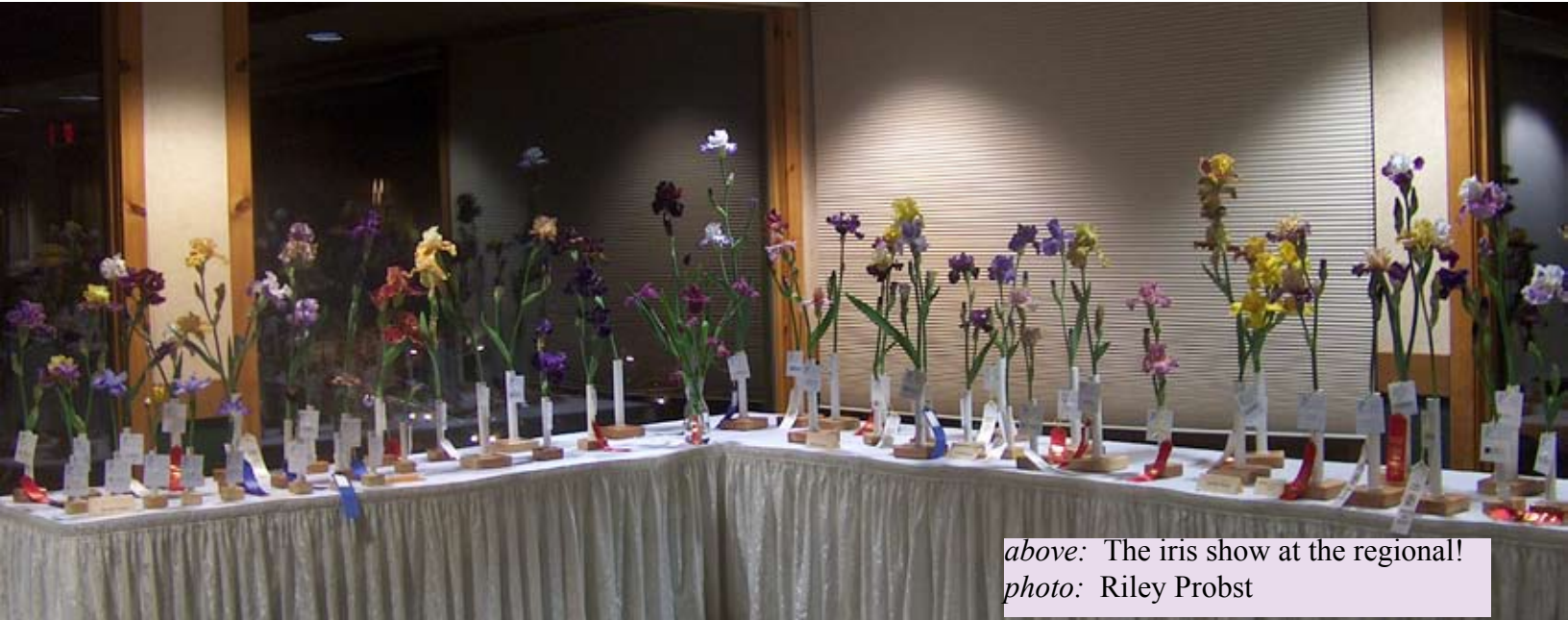
above: The iris show at the regional!