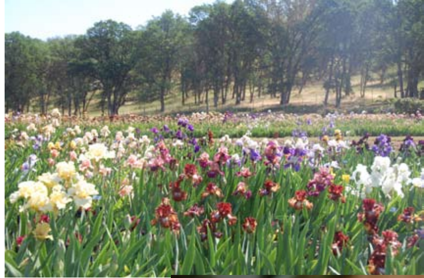
above: Superstition Iris Gardens