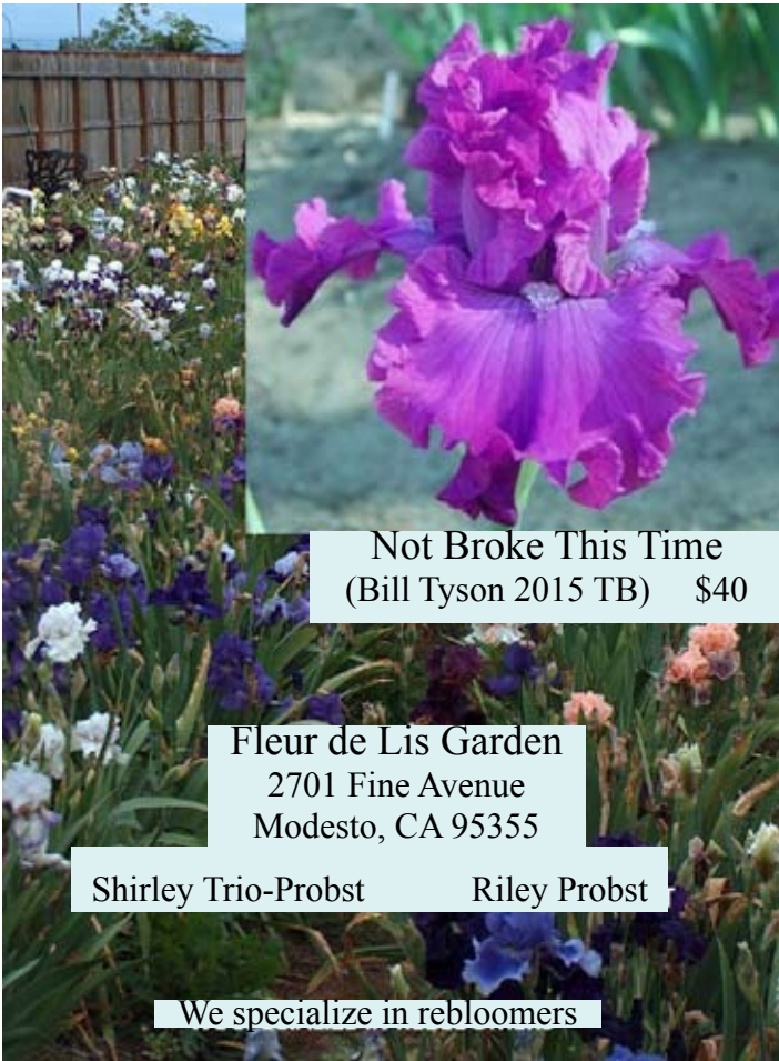
Not Broke This Time (Bill Tyson 2015 TB) $40