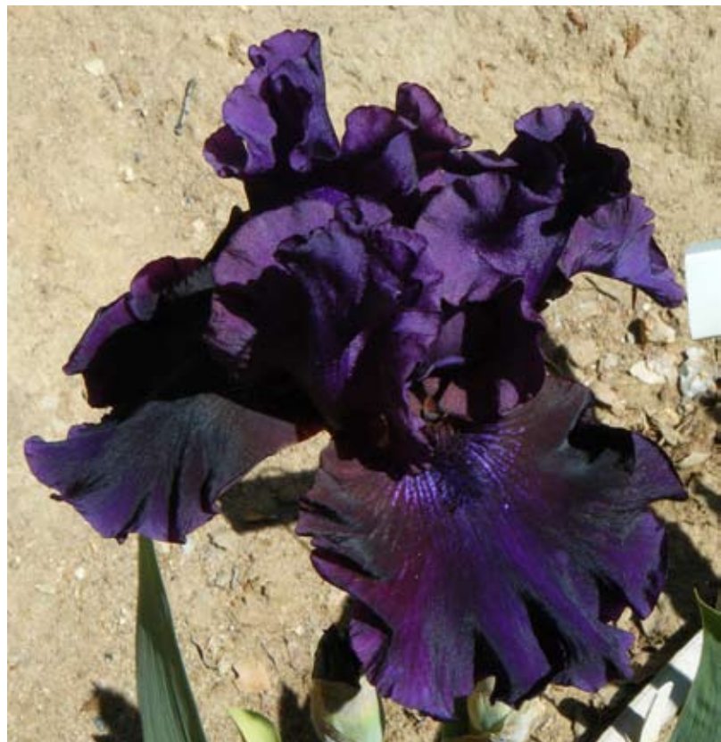
Coal Seams (Schreiners 2013)