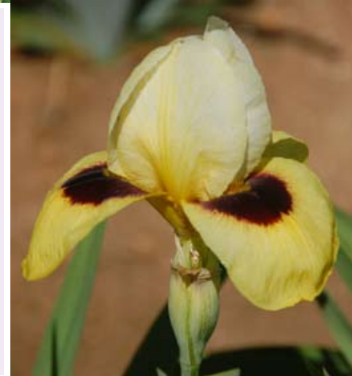
right: Dragon's Eye (Tasco 2015)