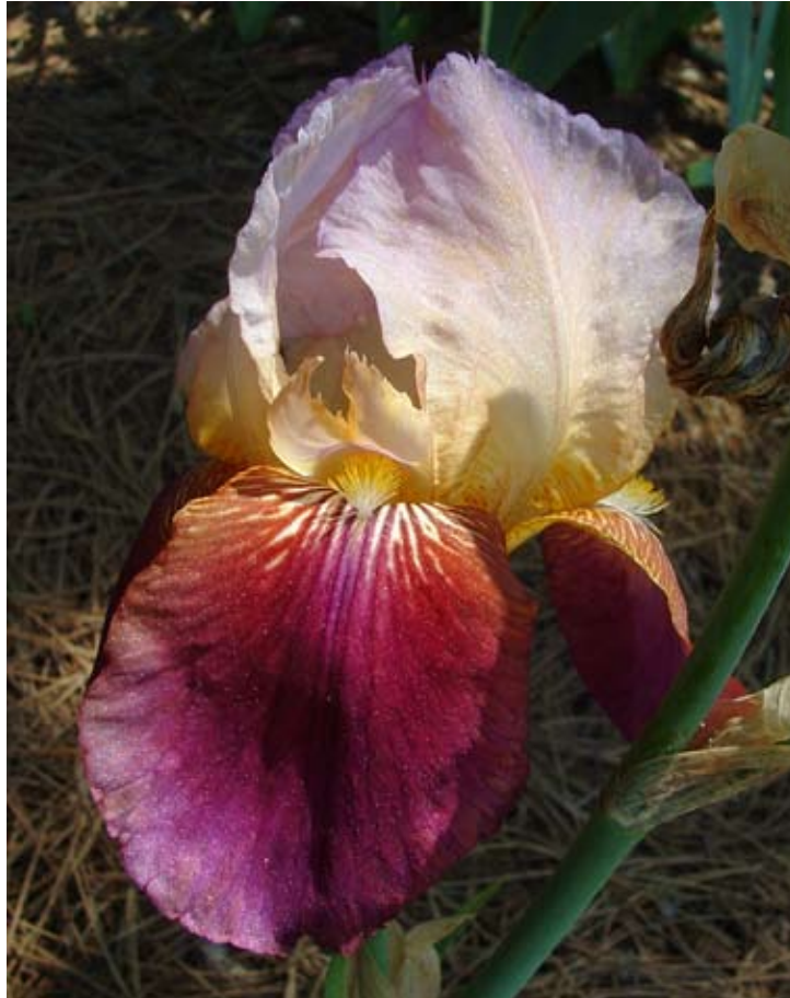
Coralie (Ayres 1932), looking happy at Bluebird Haven

week for three hours. This year I dropped to watering for two hours every two weeks – just enough to keep the irises alive and with the hope the well would hold up, as we were hearing of people whose wells were going dry. One of the claims compost tea proponents make is that treated plants become much more drought resistant or at least require less water to grow than non-treated plants.