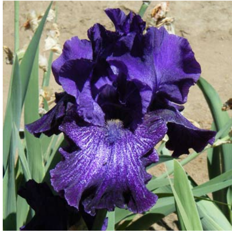
Midnight Rain (Lauer 2013)

After the visitors had taken good looks at the guest iris plantings, and Bill's extensive personal iris plantings (and perhaps purchased a potted iris or two), they eventually retreated from the warm sun to the shade of Bill's back patio for refreshments. In the late afternoon we said farewell and boarded the vans for the trip back to the Pines, after an excellent day of garden visits.