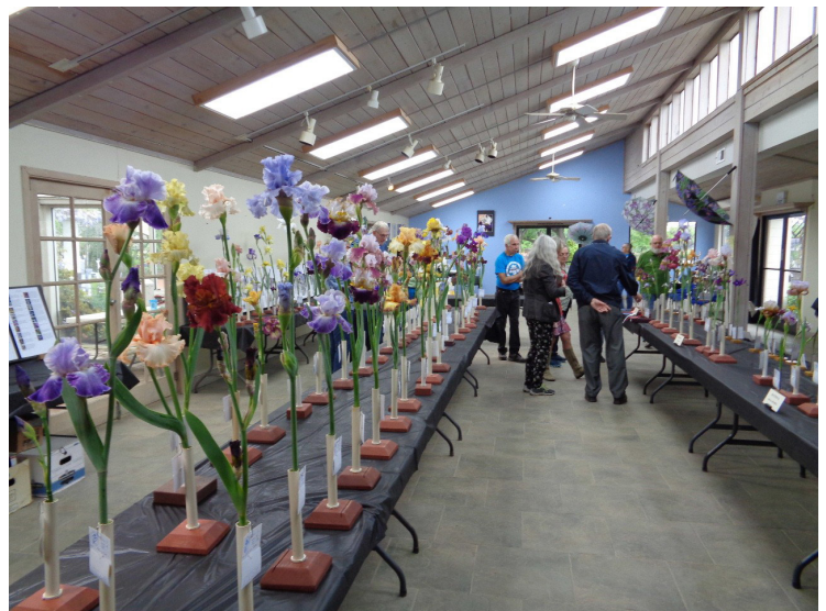
Iris Show at Alden Lane Nursery in Livermore, CA.

Club members throughout the day assisted buyers with helpful growing tips, expert advice and iris knowledge. We sold over 225 potted iris over the 2 day weekend event. We gained 1 new member too. A special thank you