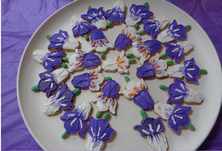
Homemade purple and green iriscookies.