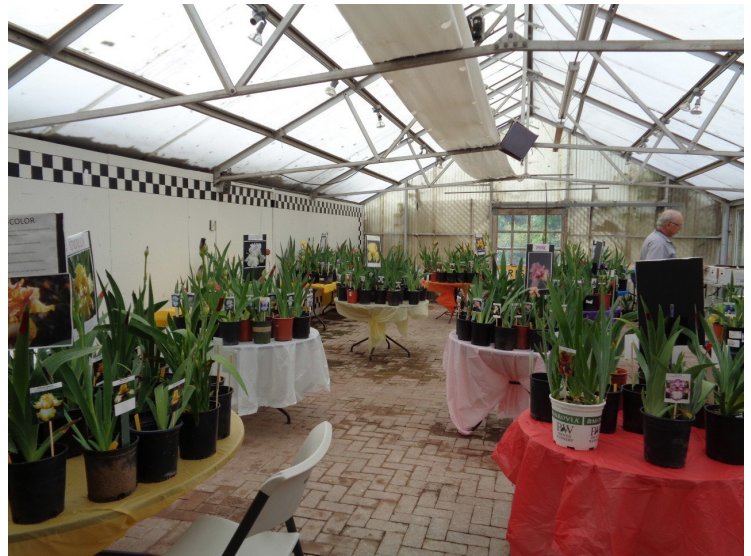
Potted iris sale at Alden Lane Nursery in Livermore, CA.

Our Club had a successful and profitable early April iris show and potted iris sale at Alden Lane Nursery in Livermore, CA. It was very well attended by the public with many iris buyers. We unfortunately had a hard down pour of rain in the morning but it cleared by the time the show was open to the public at 1:00 pm. Best of the Show iris was Air Hog TB 2009 by Hybridizer Tom Burseen. The exhibitor was Eileen Roark.