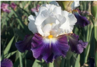
S. Trio 2012 TB $12