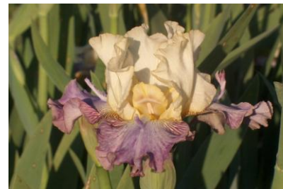
R. Probst 2013 TB-SA $15