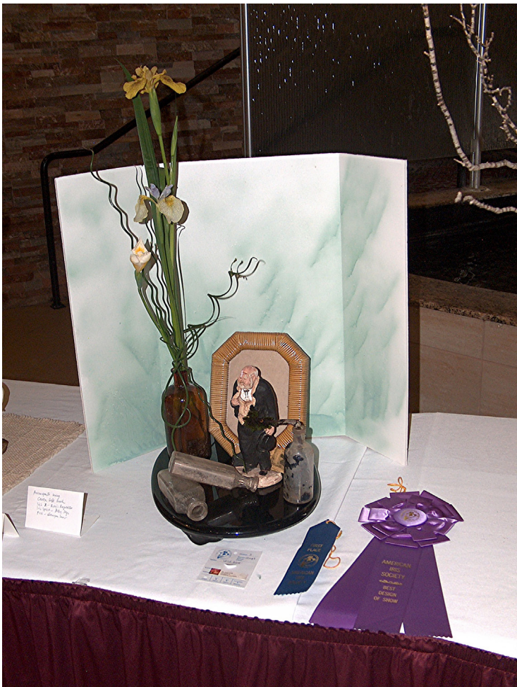
Best Artistic Design depicting the "Wild West" category By the Master of Design Anna Cadd.