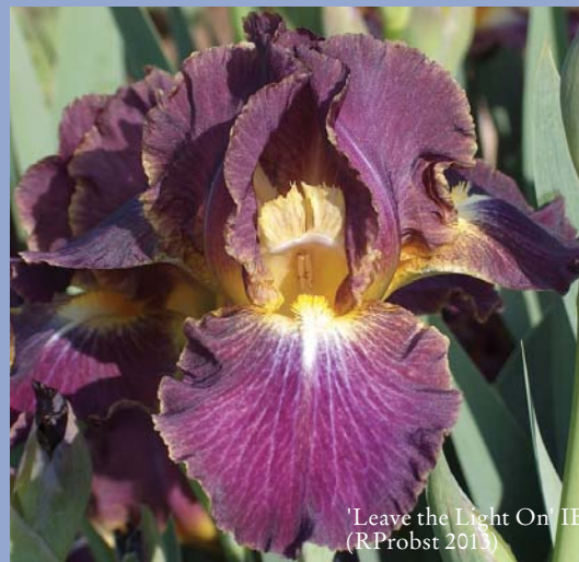
'Leave the Light On' IB (RProbst 2013)