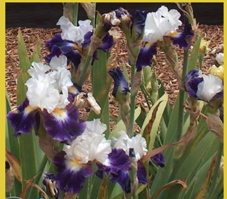
'Opposites' (Trio 2012)