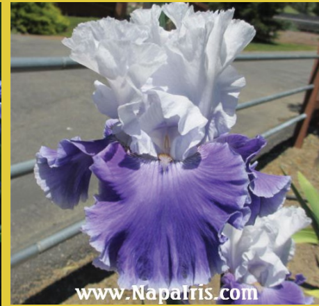
'Under the Boardwalk' (LPainter 2012) www.NapaIris.com