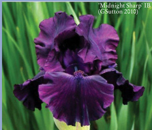
'Midnight Sharp' IB (GSutton 2010)