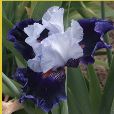
Fred Kerr seedling (see note facing page regarding the number)