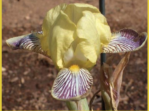
'Holiday in Mexico' (RProbst 2012)