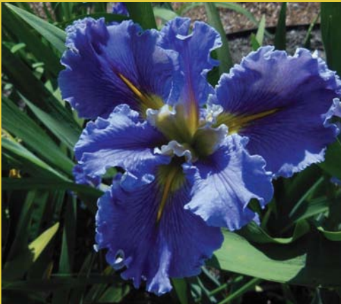
'Swirling Waters' (Heather Pryor 2001)