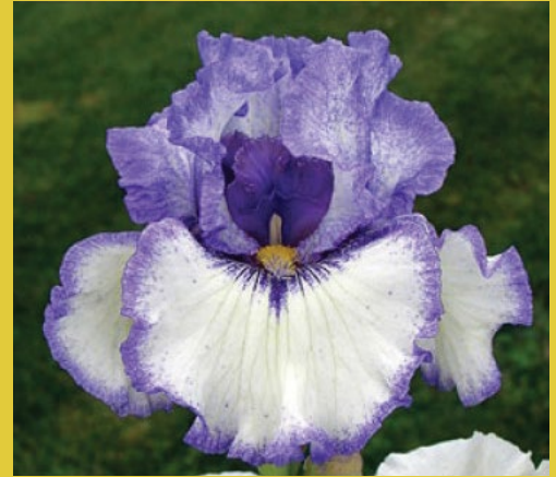
'Blueberry Trail' (GSutton 2012)