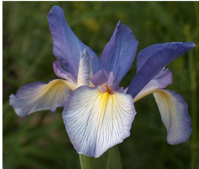
below: Speeding Star (Cadd 2002) spuria