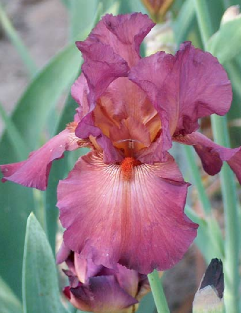
above left: Lady Friend below: Golden Panther