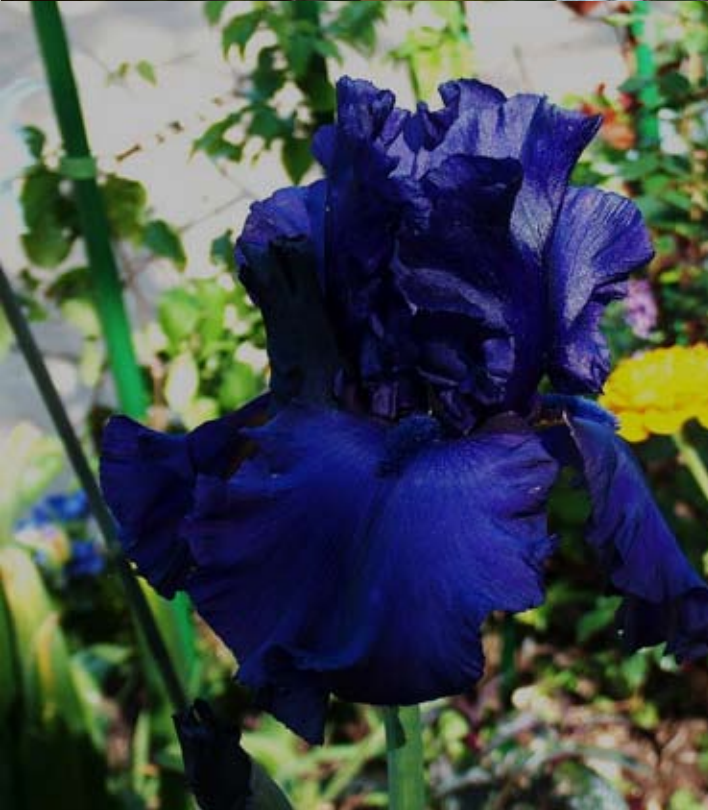
left: Dusky Challenger

(see That's All Folks on the cover page)