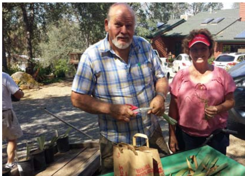
above: Two YIS youth members potting up irises for YIS Fundraisers 2016.