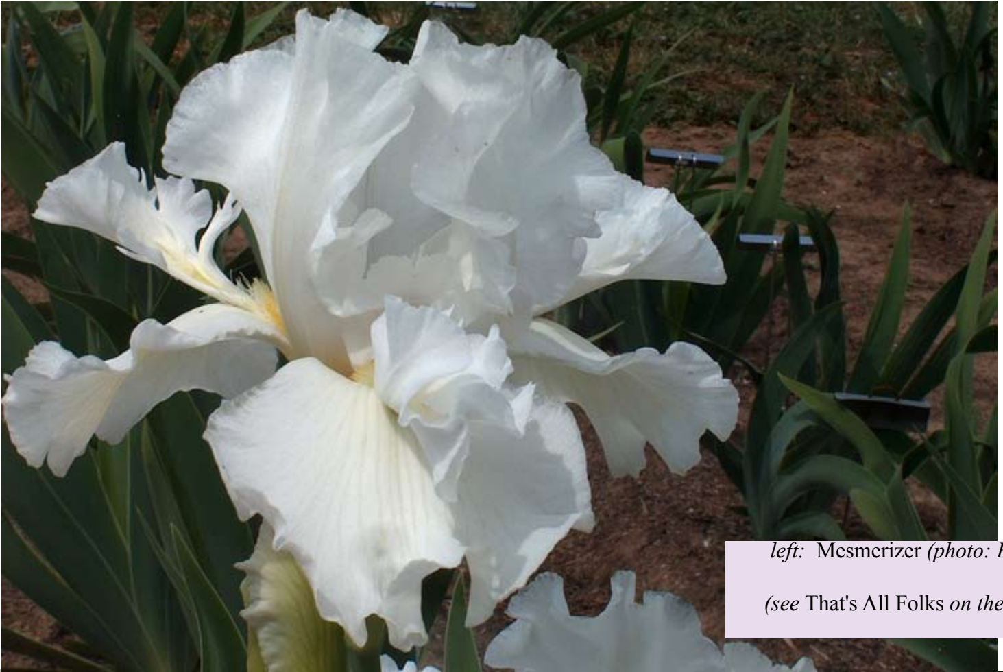
left: Mesmerizer

(see That's All Folks on the cover page)