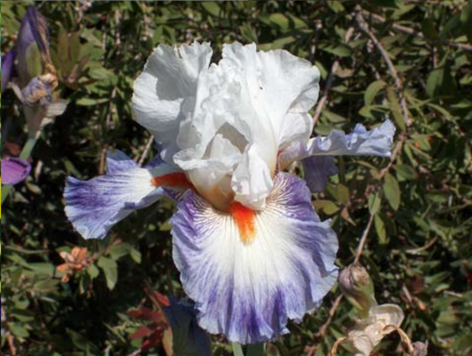
right: Gypsy Lord