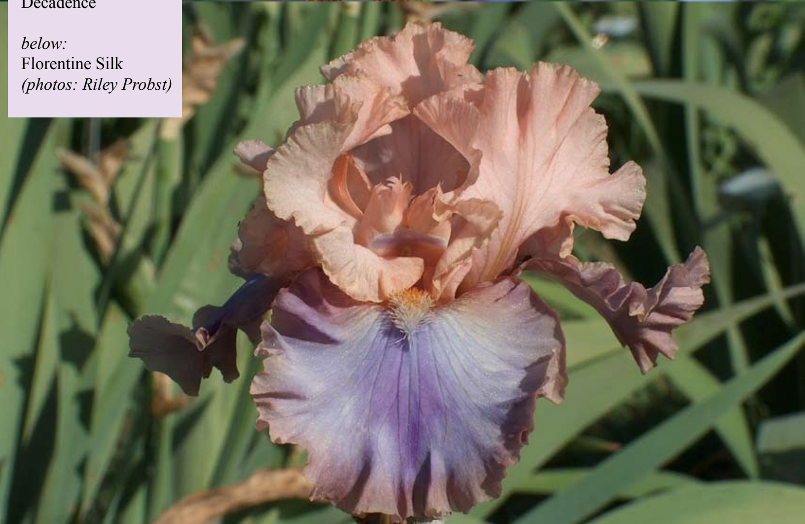
below: Florentine Silk