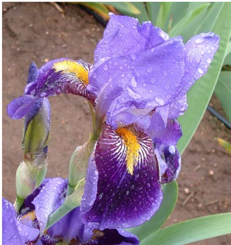
above: Dominion (Bliss 1917) below: Evolution (Cayeux 1929)