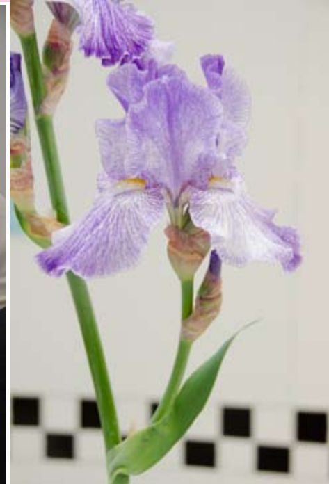
My Generation, best TB rebloomer