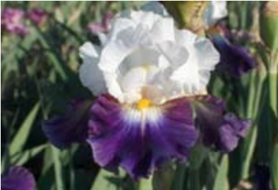
S. Trio 2012 TB $12