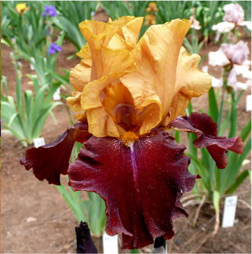
Fight On (Annand 1996)