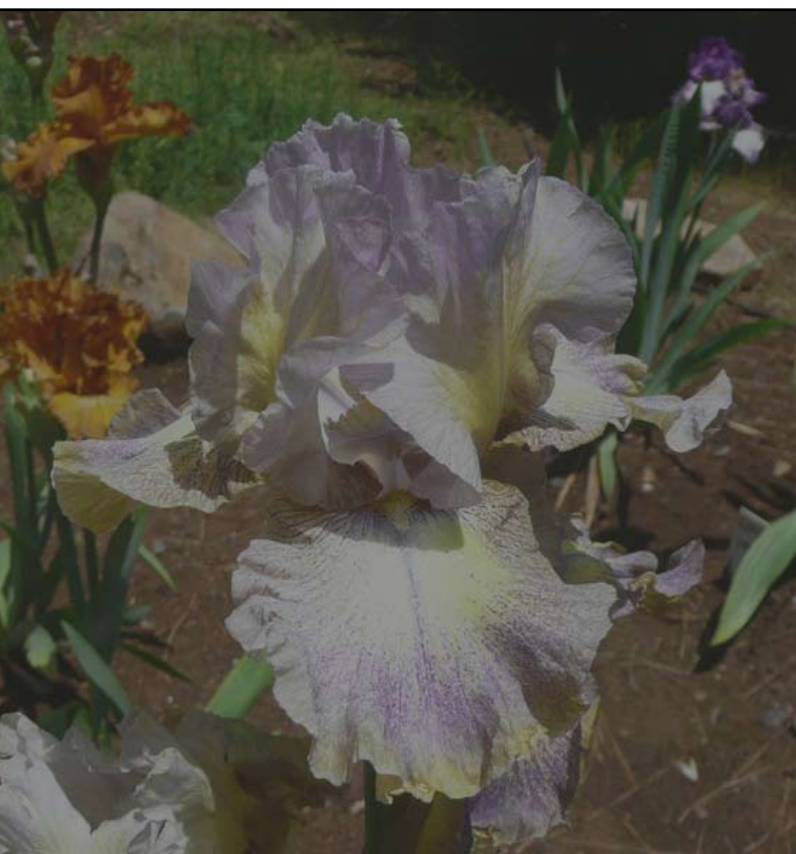
Desert Sketch (Robert Annand 1993)