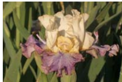
R. Probst 2013 TB-SA $15