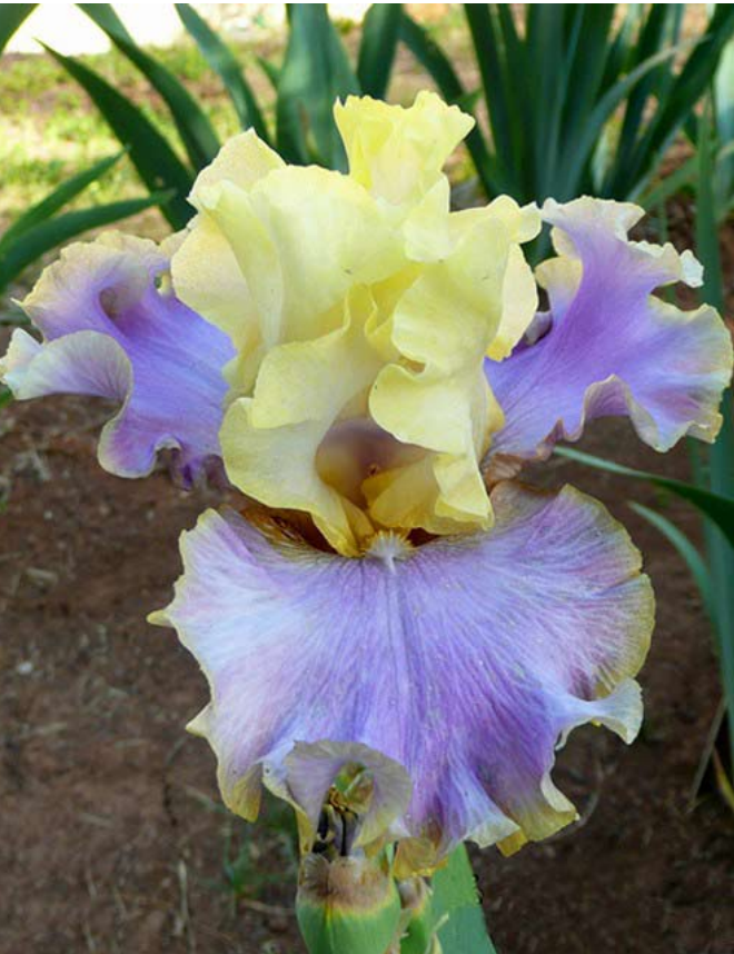
Kona Waves (Annand 2005)