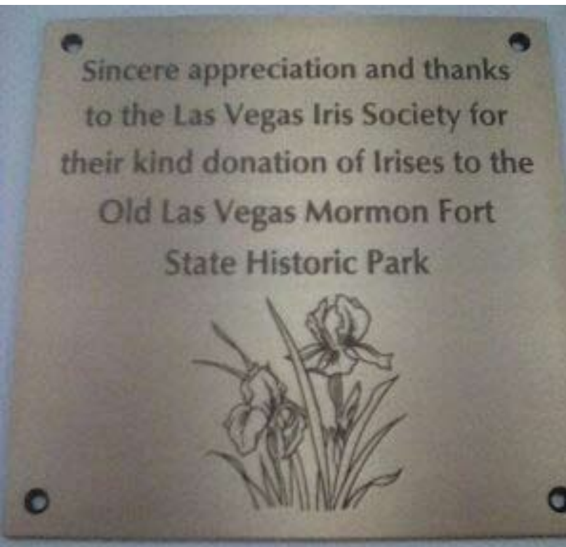
above: Plaque awarded to LVIS for work on a beautification project for the city of Las Vegas historic area known as the Old Mormon Fort. LVIS planted iris all around the fort, many of them rebloomers.

We are trying something new this year as there was little enthusiasm for people to accept nominations. We will be having two members share each position of President, Vice President and Secretary, and have one person hold the position of Treasurer.