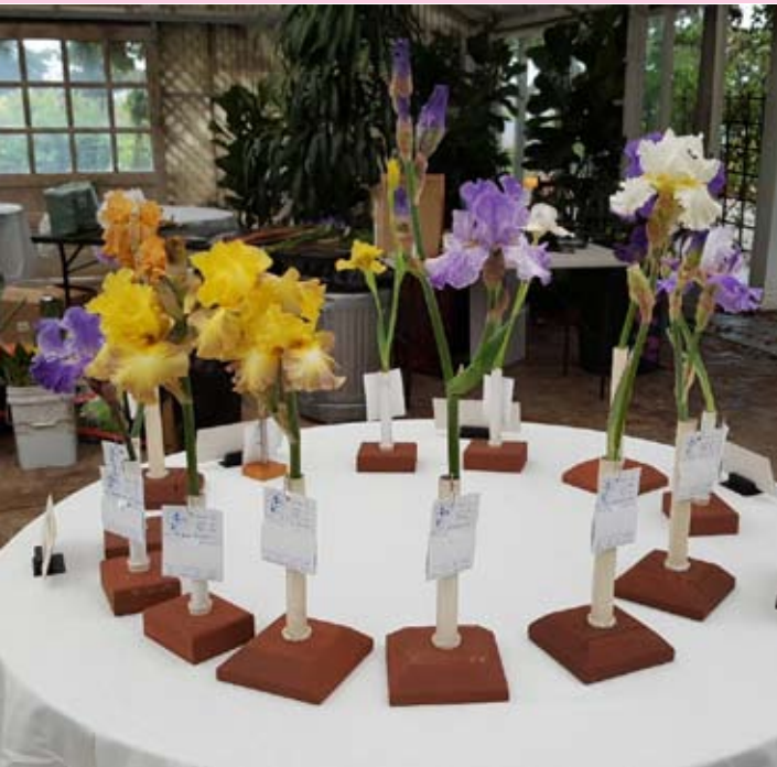
above: Reblooming show