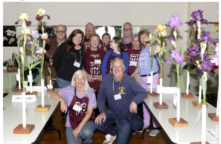
above