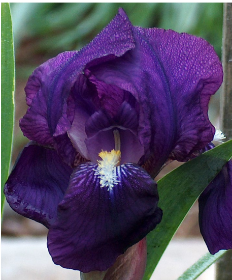
Crimson King, Barr, 1893