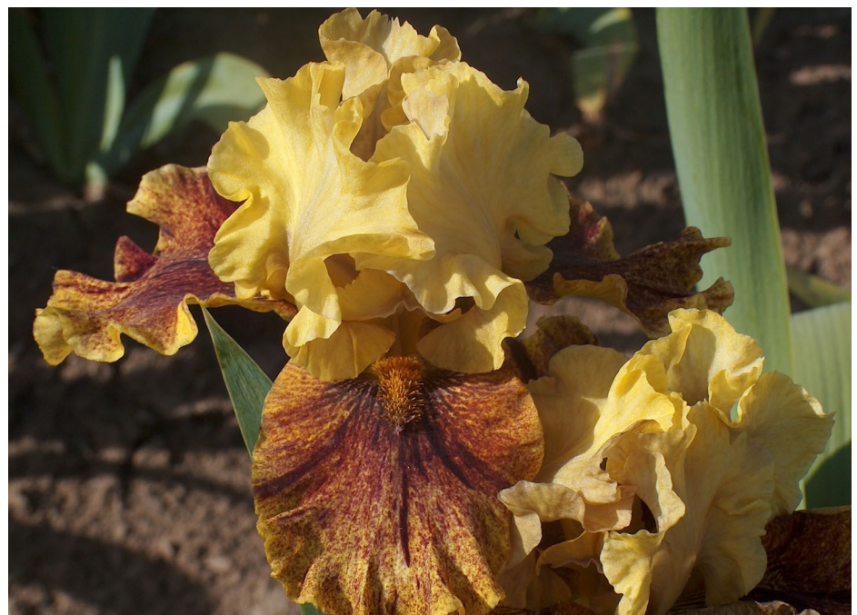
Advantage, Paul Black, 2012