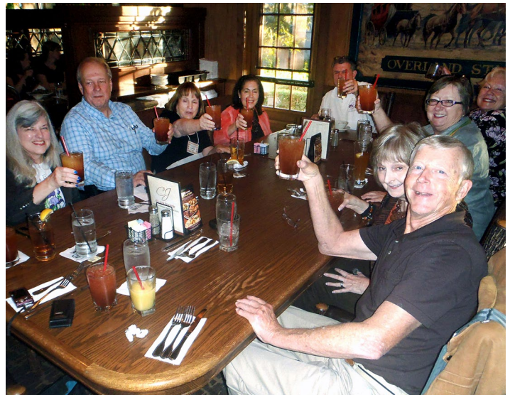
Happy members share mealtime at Fall Regional

Let's conspire to make 2012 the year where we INCREASED membership!