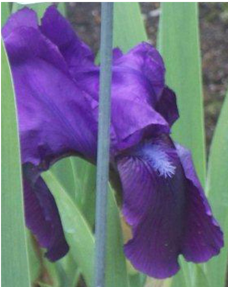
Eleanor Roosevelt, Sass, 1933