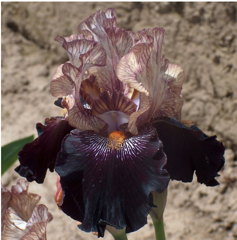
Action Packed, Paul Black, 2011 Riley Probst